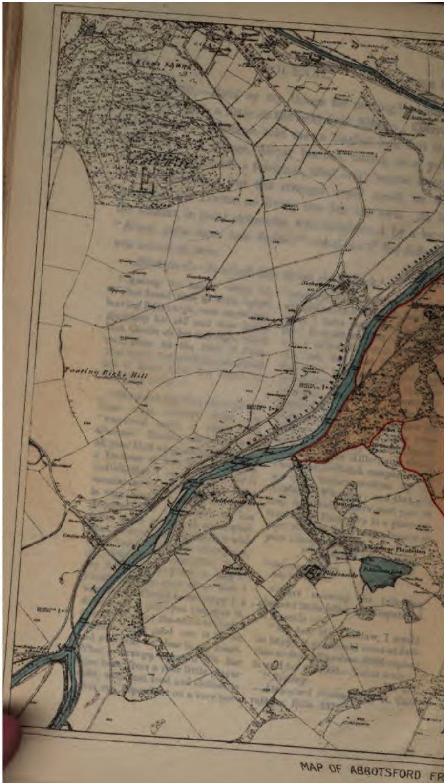
MAP OF ABBOTSFORD FR